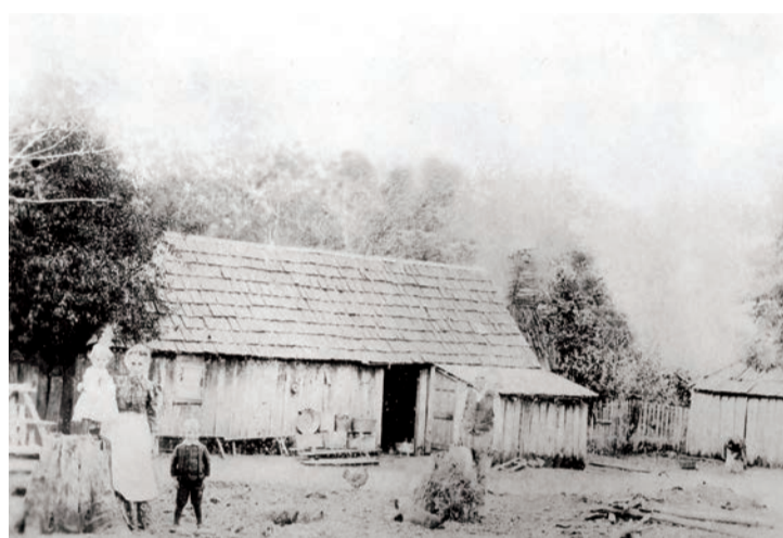
The home that once stood in Butterfield Park.