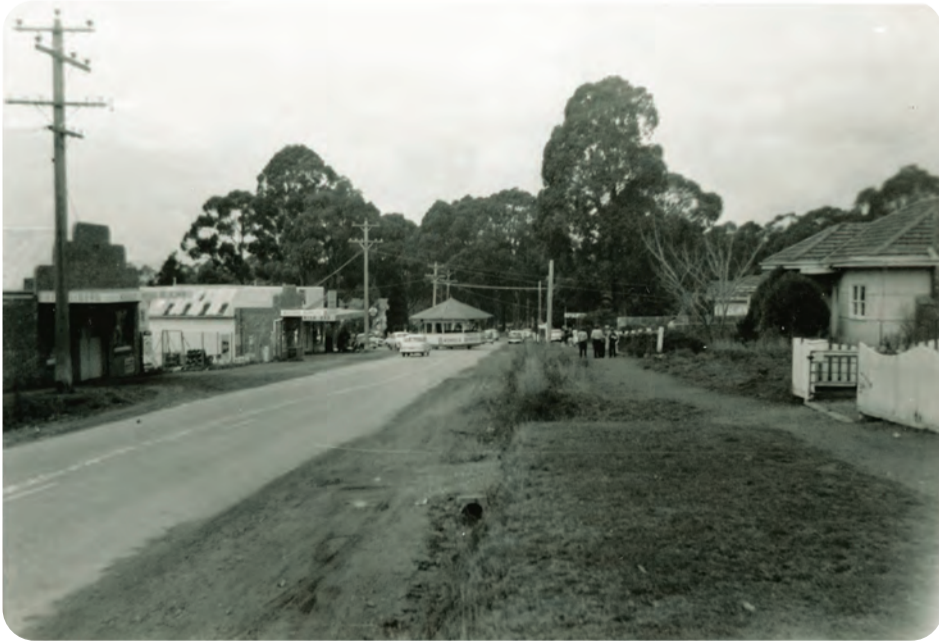
Moving Shingler's Rotunda to the Recreation Ground 1960.

*A char-à-banc is a type of horse-drawn vehicle or early motor coach.