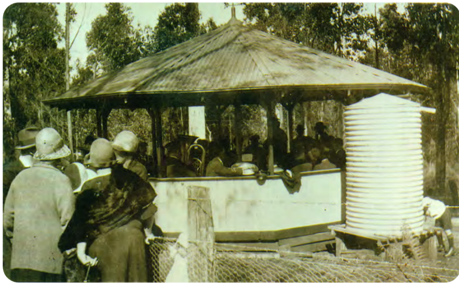
Shingler's Rotunda Monbulk 1930s.