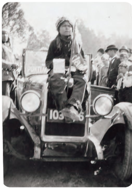
American Indians in their native dress at the 1926 Hospital Sunday.