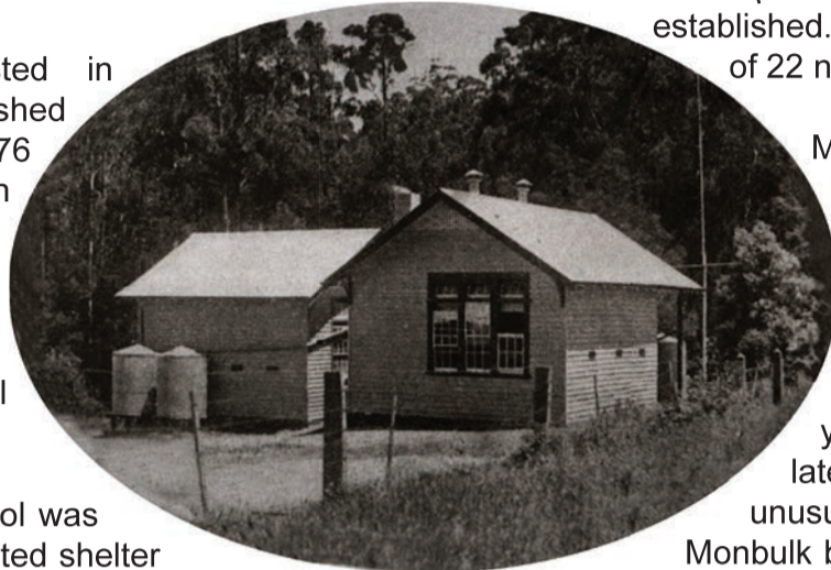
Kallista State School 1936